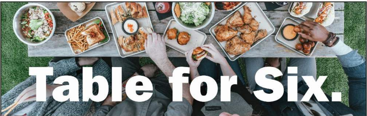
Table for Six.